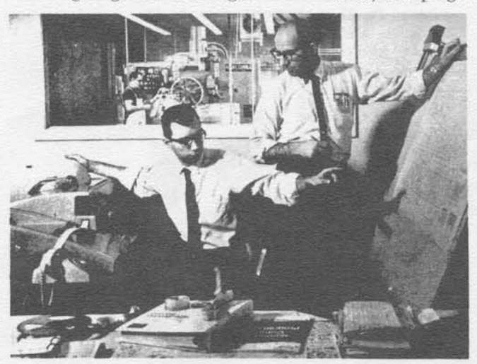
TALKING TO A LARGE COMPUTER located in another city, this parts programmer is able to prepare control tapes for NC machine tools in his plant in a few minutes. The computer is .nked to the teletypewriter by telephone lines. The time sharing service is from General Electric.

Even today, the service can be used to prepare tapes for contouring operations on many two-axis point-to-point machines. Most firms are not taking advantage of this capability of their machine tools at present because man-