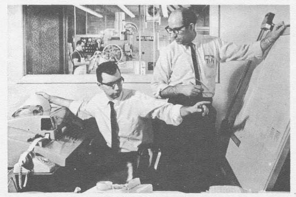
Communicating with a computer from a teletypewriter, parts programmers prepare coded tapes from engineering drawings. Using a computer, they can quickly correct errors discovered in the tape before a machine, set up for a job, begins production.

Several manufacturers have cut down on the time it takes to get parts off the drawing board and onto the production line by hooking up with General Electric's recent nationwide extension of its computer time-sharing service.